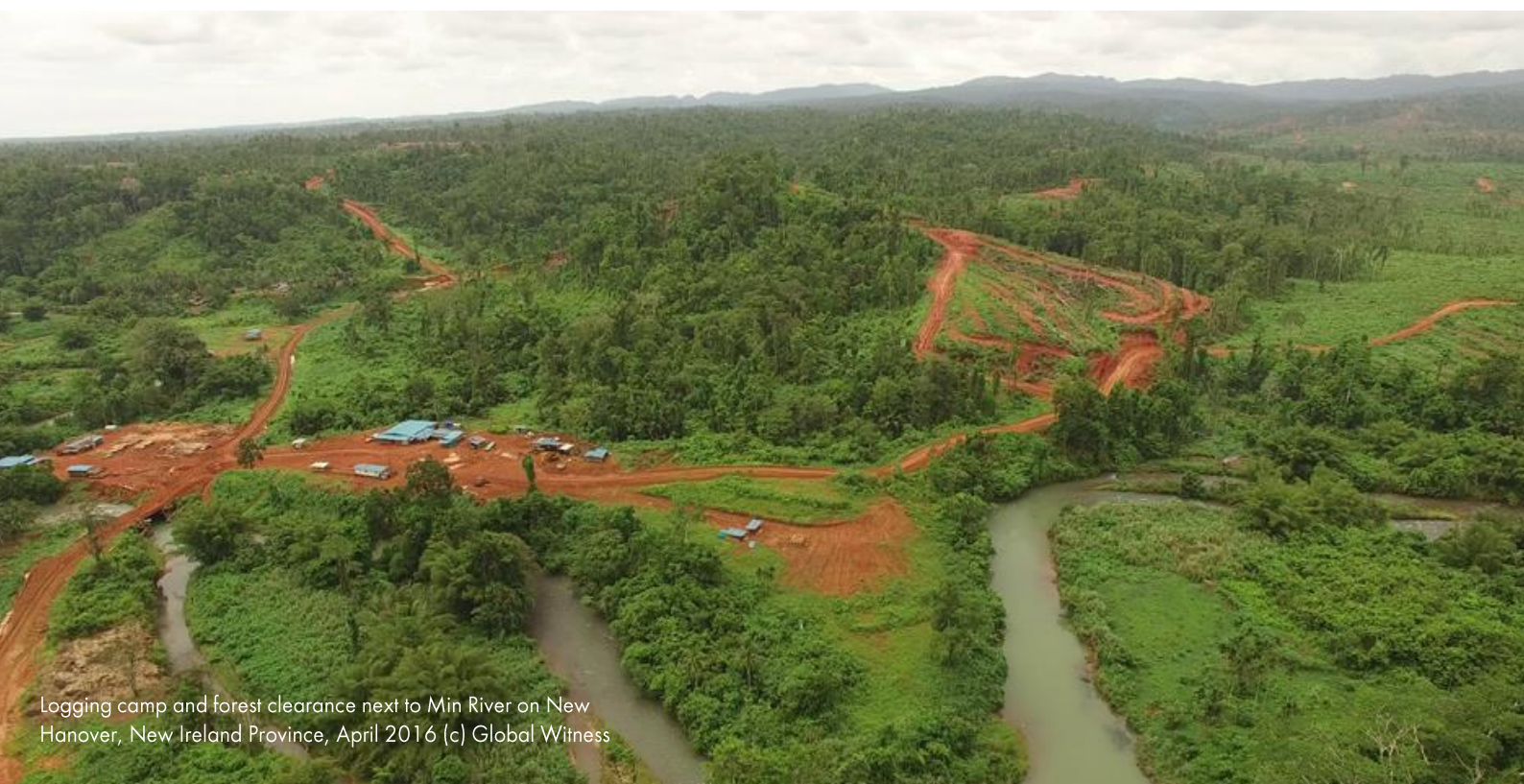
Logging camp and forest clearance next to Min River on New Hanover, New Ireland Province, April 2016

This report explores these transactions in more detail. Part 1 provides background on the three non-bank lenders that are the focus of this report: Heduru Moni, First Investment Finance and Hastings Deering Limited. Part 2 looks at how each of these companies has provided support to logging companies, via loans secured on vehicles or properties. Part 3 discusses the implications of this support and how non-bank lenders may be complicit in supporting illegal or unsustainable logging. Part 4 sets out a series of recommendations for lenders and the PNG Government.