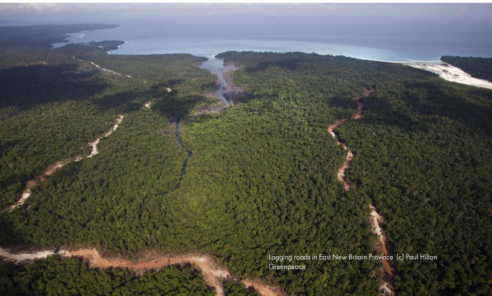
Logging roads in East New Britain Province

Given the potential for its equipment to be used in deforestation – and the mounting evidence of human rights abuses in PNG’s logging industry – it would seem important for Hastings Deering to address the potential inconsistency between its customers’ activities and its commitments to sustainability and human rights, and explicitly set targets and binding commitments relating to deforestation and the downstream human rights impacts of its operations.