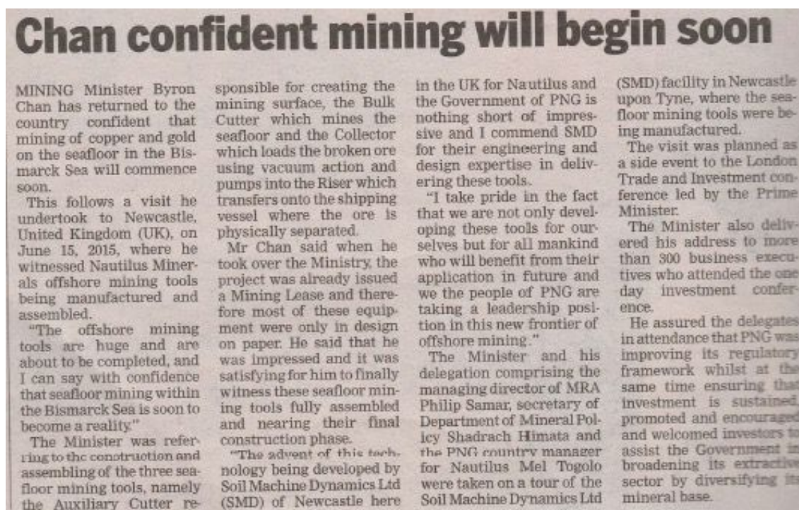
Figure 5: Seabed mining is another example of the addictive dependence on mining as the basis for PNG's economic development pathway.

These statements by Chan runs contrary to the intentions of the Vision 2050 which seeks to facilitate mass-based development “once strong growth has been achieved in the mining industries and the renewable resource-based exports, it is important to use that income to create more opportunities to grow the economy” (GoPNG, 2010:3). On the one hand the Vision 2050 compels government to draw down its dependence on the extractive sector, but on the other hand it continues to ensure that the mining sector is relentless in its activities.