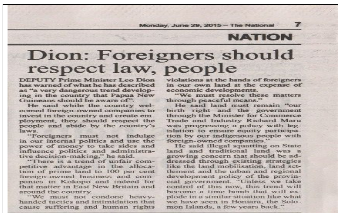
Figure 2: The prophetic words of the Constitutional Planning Committee are made manifest in present-day dealings with foreign investors.

"It is essential that we be highly selective as to the type of enterprise we allow into this country - not only should we very carefully consider whether the industry which a foreign company proposes to establish is in accordance with our national objectives, but we should thoroughly investigate the history of the company's activities in other countries. We must not allow any foreign enterprise to operate in our country unless we can be sure that it will fully abide by our laws, and will not make any attempt to interfere with our political and civic affairs " (Constitutional Planning Committee Final Report, Chapter 2, para.73) (emphasis ours).