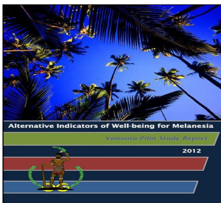
Figure 4: Vanuatu is at the forefront of using culture and Melanesian-defined indicators to measure national well-being.

It is worth highlighting here the experience of Vanuatu – another Melanesian country ( Figure 4 ). The Vanuatu Malvatumauri National Council of Chiefs in 2012 “completed a pilot study on well-being which measures happiness and considers variables that reflect Melanesian values” (Alicka Vuti, in Malvatumauri National Council of Chiefs, 2012: i). In this alternative approach to defining individual and community well-being, “three unique domains of well-being” are utilized to measure the state of well-being for ni-Vanuatu citizens – “resource access, cultural practice, and community vitality” (ibid.). The ni-Vanuatu experience in defining how development should be measured demonstrates creativity and an empowering exercise in bringing to the fore Melanesian-oriented aspects of life in a predominantly agrarian and communal society. One will also notice that access to customary land and literacy in indigenous language are privileged as realistic indicators in measuring the level of happiness in a Melanesian context.